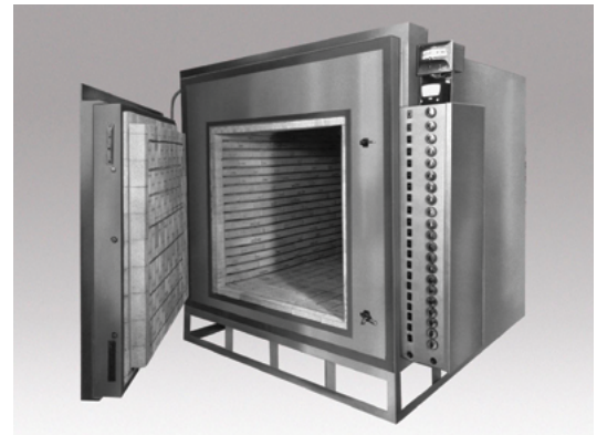
The Econo-Heat™ furnace shown is a custom unit designed for an aerospace manufacturer for use in heat treating. This furnace has a work area of 42" x 42" x 65", and a unique temperature control system consisting of 21 elements each with its own infinite control switch to permit uniform heating of complex shapes.