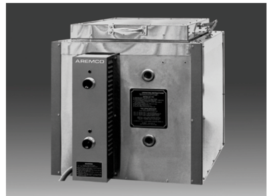
Econo-Heat™ 2931 Top-Loading Furnace. This model has a work area of 17" x 20" x 17" and is capable of 2400 °F operation using single phase service, 240 Volts and 40 Amps.