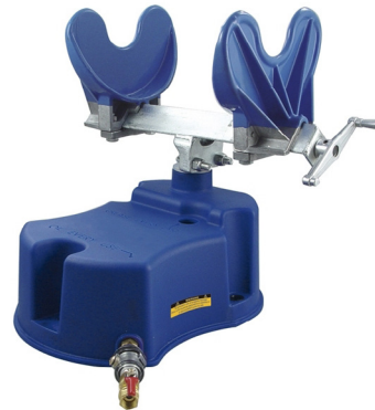
Model 7000 Mixer