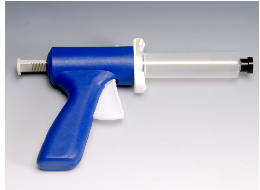
8200 30cc Dispense Gun