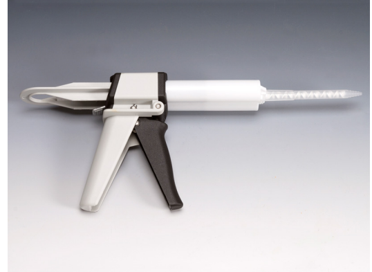
9700 50ml Dispense Gun

Larger cartridge sizes including 75ml, 200ml and 400ml are available upon request.