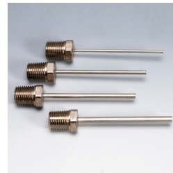
8535, 8540, 8545, 8550 Stainless Steel Needles