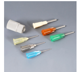
992X Nozzle Adapter and Needles