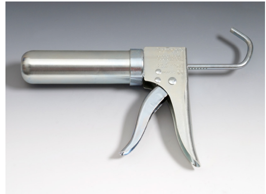
8500 6 oz. Dispense Gun