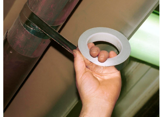
Pyro-Tape™ 682-HR Heat Reflective Tape